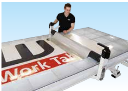
8. Now let the table do its job by simply pulling the roller along the table.