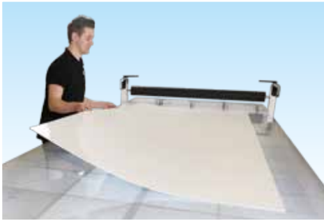
1. Place the substrate on the table.