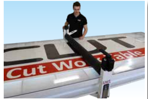
3. Lower the roller for fixation.