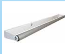
Extra roll holder