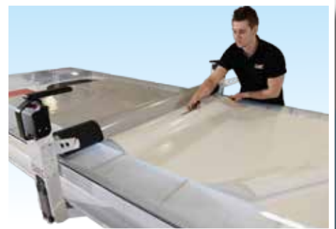
6. Remove any excess liner.