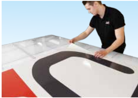
2. Place your adhesive material on top of the receiving material.