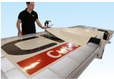
4. Pull the adhesive material halfway over the roller.