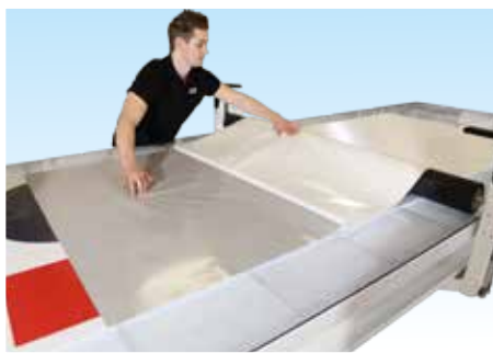
5. Gently remove the liner.