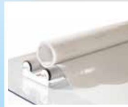
Media roll holder