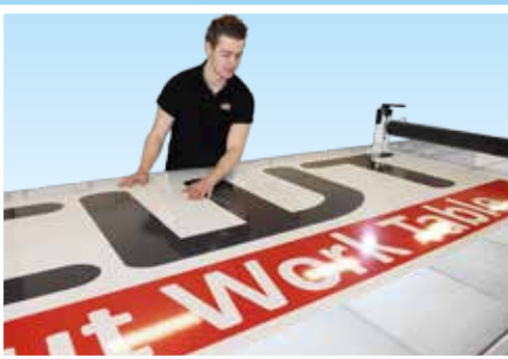
10. Done! No hassle and no bubbles!