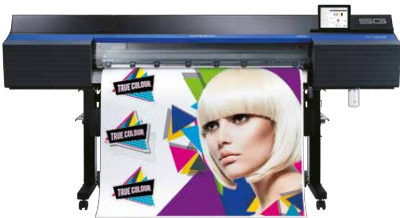
SG-540 (1,371 mm wide)