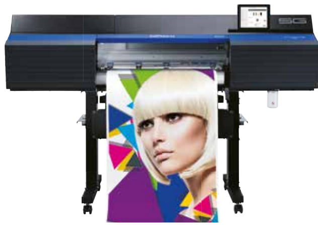
SG-300 (762 mm wide)